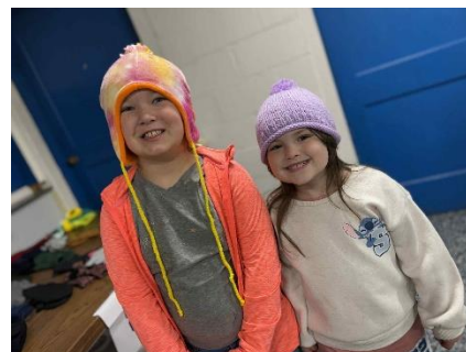
A couple of Operation Warm Happy Customers!