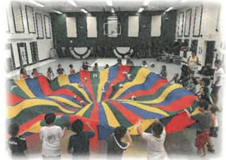
Project QUEST at BES

On behalf of our TTCC Staff & Board we thank you!!