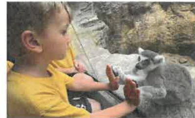
A memorable high-five for this TTCC camper at the Franklin Park Zoo