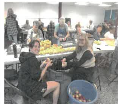
Apple Festival Prep with our awesome Team of Volunteers!