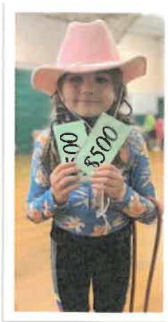
Earning some play money at Wacky Western Day!

The TTCC is such an awesome organization... and I wish that I was able to really express how much it means to me. I have no doubt that it has shaped me to become a better person and friend and someday a better teacher and parent. - from a former TTCC Summer Camp Counselor