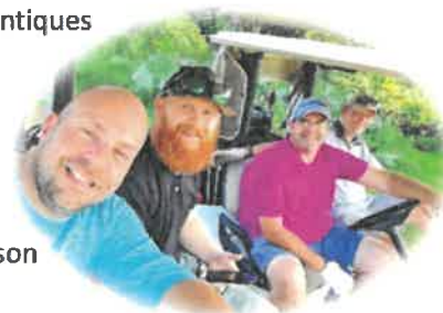
Having fun at the TTCC Golf Tourney