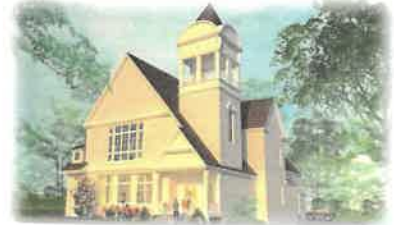
Architectural Drawing of TTCC

A community's heart and soul is made up of all its people coming together for a common cause, helping each other through the day-to-day and being there when something is asked of us. The Tapply-Thompson Community Center (TTCC) has enjoyed unparalleled support at every step this past year as we work on our expansion efforts to continue meeting your various needs.