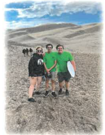
Westward Bound at Great Sand Dunes